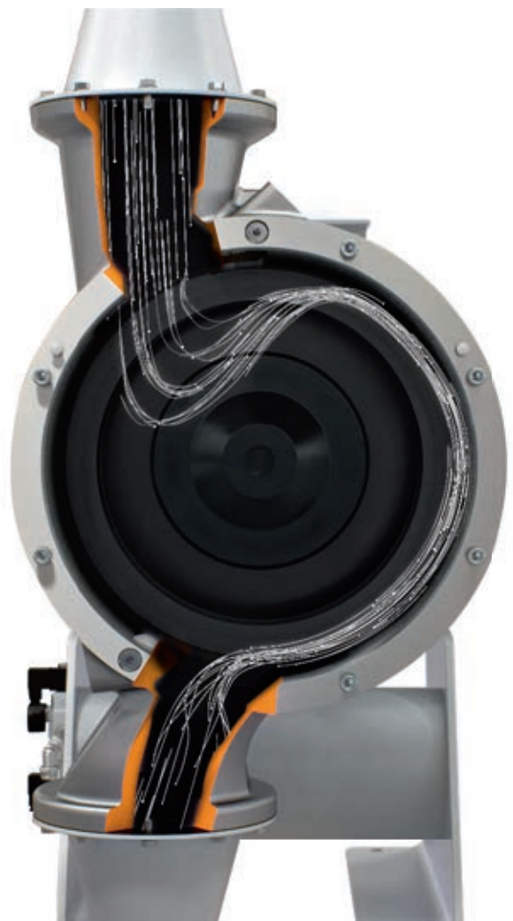
Multiple impacting on the basis of the crosscurrent principle.