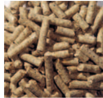
Pellets: Animal feed

The Buhler Grain Technology Center is the world's best-equipped and most renowned development and test center in the field of industrial processing of grain and pulses.