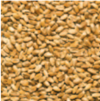
Grain: Wheat, rice, maize